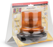
Part No. 128AMF

Magnetic mount not recommended for highway use.