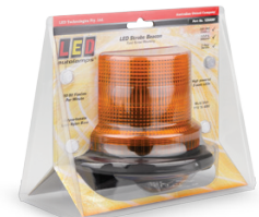
Part No. 128AMM