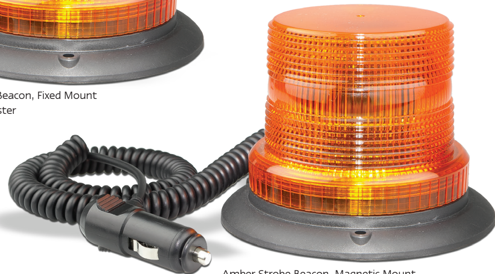
Amber Strobe Beacon, Magnetic Mount 128AMM - Blister