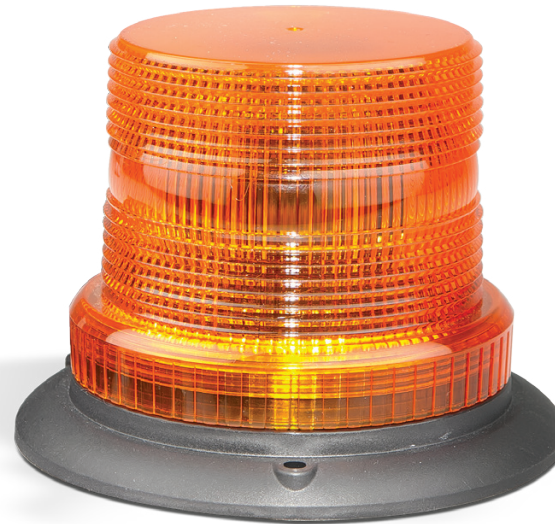
Amber Strobe Beacon, Fixed Mount 128AMF - Blister