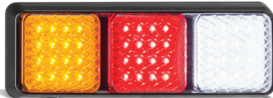
Stop/Tail/Indicator/Reverse 282ARWM - Blister, 12-24 Volt 282ARWMB - Box, 12-24 Volt