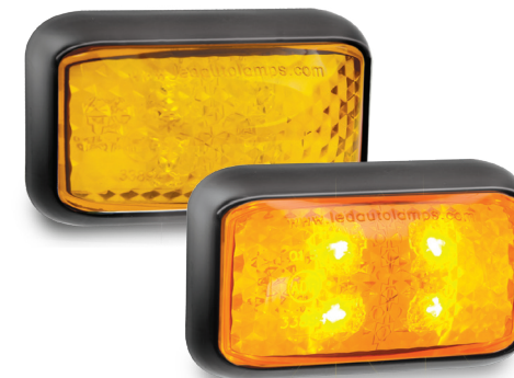
Part Number 35AM - Blister Single 35AMB - Single Bulk