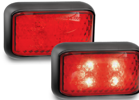
Part Number 35RM - Blister Single 35RMB - Single Bulk