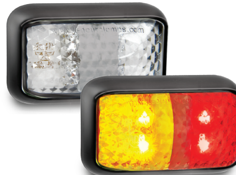
Part Number 35ARM - Blister Single 35ARMB - Single Bulk