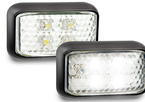
Part Number 35WM - Blister Single 35WM2 - 2m Cable, Single Bulk