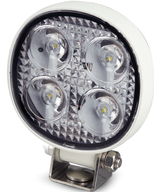
Reverse/Flood Lamp, White E-Coated 7512WM - Blister