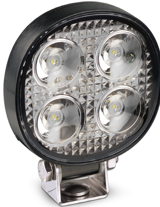
Reverse/Flood Lamp, Black E-Coated 7512BM - Blister