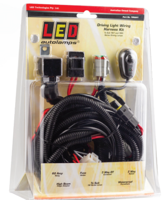
P/N. TIRWH1 - Blister

2 Way Switch High Beam Plugin Adapter 60 Amp Relay